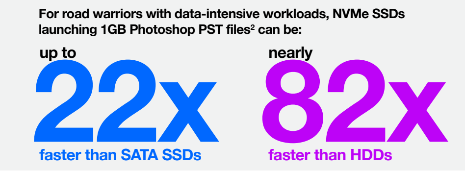
Figure 2: NVMe SSDs can launch large media files up to 82x faster than HDD2

The right storage choices can help organizations move faster, serve customers better and outpace their competition. NVMe SSDs help relieve data bottlenecks with faster load times, more efficient workflows, and multiple I/O queues ("parallelism") to lower latency. NVMe has 2000 times more parallelism than SATA<sup>3</sup>. Plus, seconds add up! NVMe SSDs are known to accelerate application performance, especially for large graphics files (see Figure 2), and decrease wait and boot times.