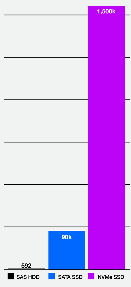
Figure 1: 4K random read IOPS for NVMe SSDs are 22x faster than SATA SSDs.<sup>1</sup>